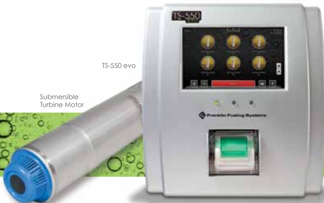
Submersible Turbine Motor