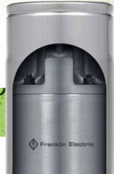
Submersible Turbine Pump with Franklin Electric Motor