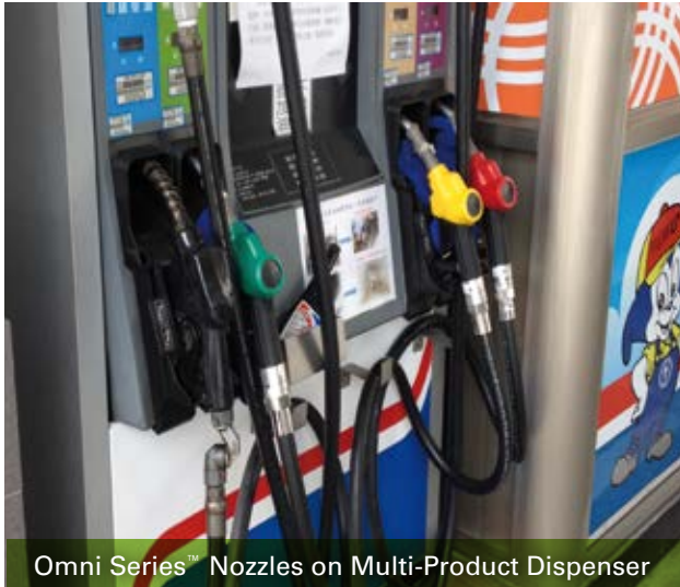
Omni Series™ Nozzles on Multi-Product Dispenser