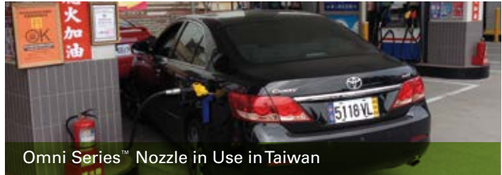
Omni Series™ Nozzle in Use in Taiwan