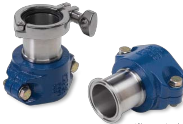
(Clamp and gasket not included.)

XP Quick Release Fittings bring a new level of ease to XP pipe installation and servicing. These installer-friendly fittings combine the clamping system found on the original XP clamshell fittings with the capability to connect seamlessly to flex connectors utilizing the connectors clamp and gasket. Installations made easier than ever with the removal of additional threaded connections. The flange and clamp also allow for quick disconnection of the pipe from a submersible pump for easy servicing.