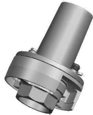
Non-galling zinc-aluminum base.