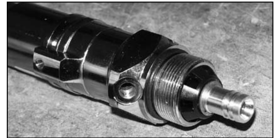
Figure 1 – Adaptor (without O-rings)