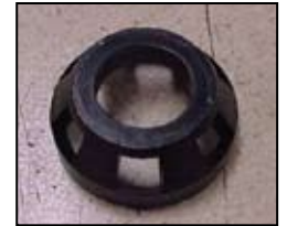
Figure 3 – Flow Restrictor