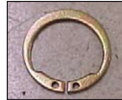
Figure 2 – Retaining Ring