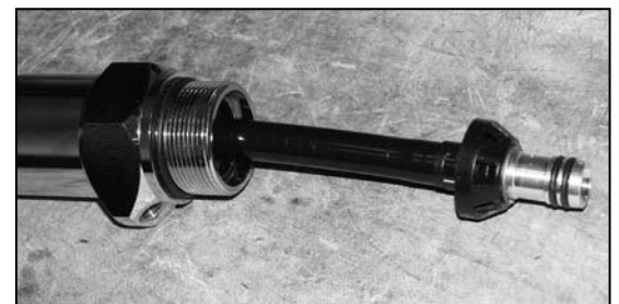
Figure 5 – Pulling Vapor Tube Out