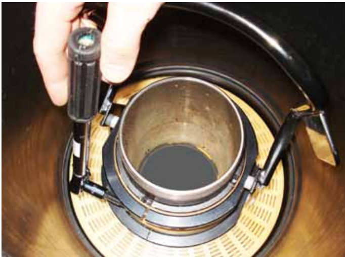
Figure 1: Wrench on Clamp

First, remove the stainless steel retainer ring (85031) that holds down the foam filter and screen assembly, by squeezing the ends together and pulling up. Remove the foam filter. Loosen and remove the hex screw (using a 1/4" drive ratchet and 3/16" hex socket) in the upper clamp.