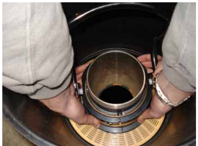
Figure 3: Install Drain Valve