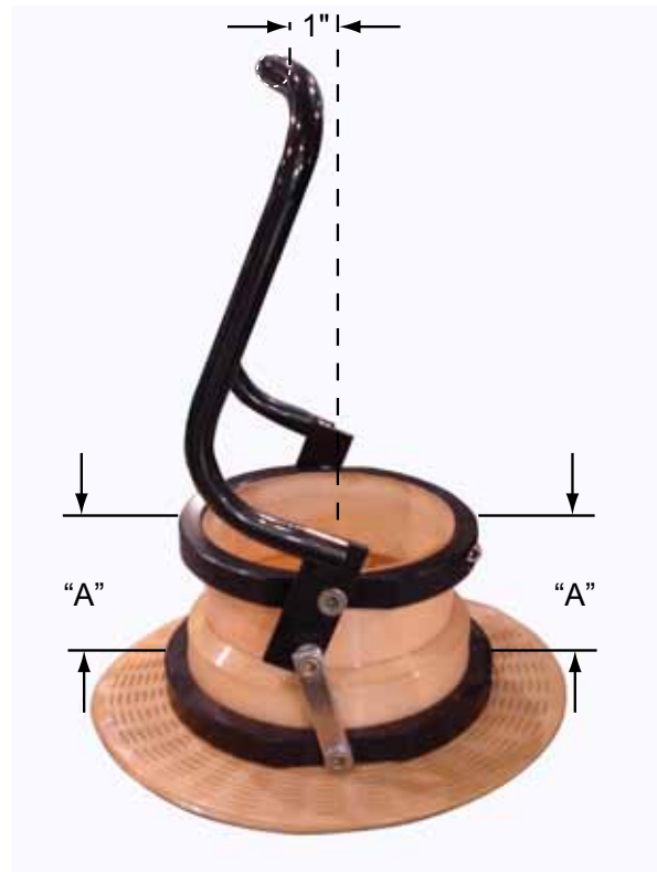
Figure 2: Handle in Raised Position