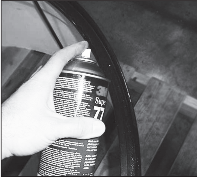
Figure 1: Spray Adhesive