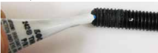
Figure 3: Apply Loctite™ to the Set Screws