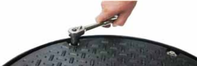
Figure 2: Loosen Bolts