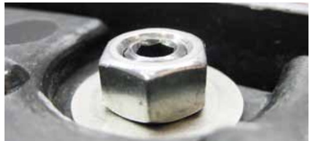
Figure 5: Nut on Set Screw