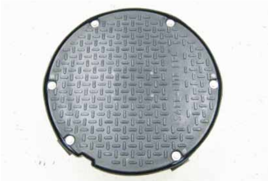
Figure 1: Lid for 818-403 Monitoring Well